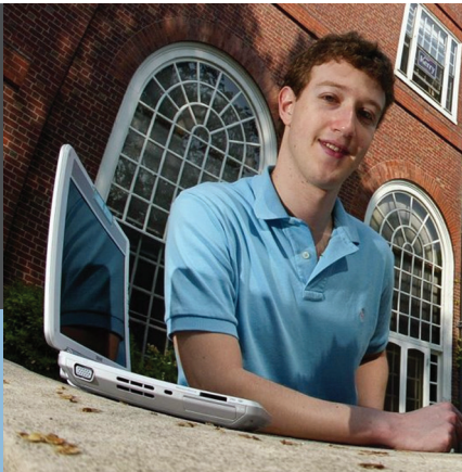
The year was 2004.